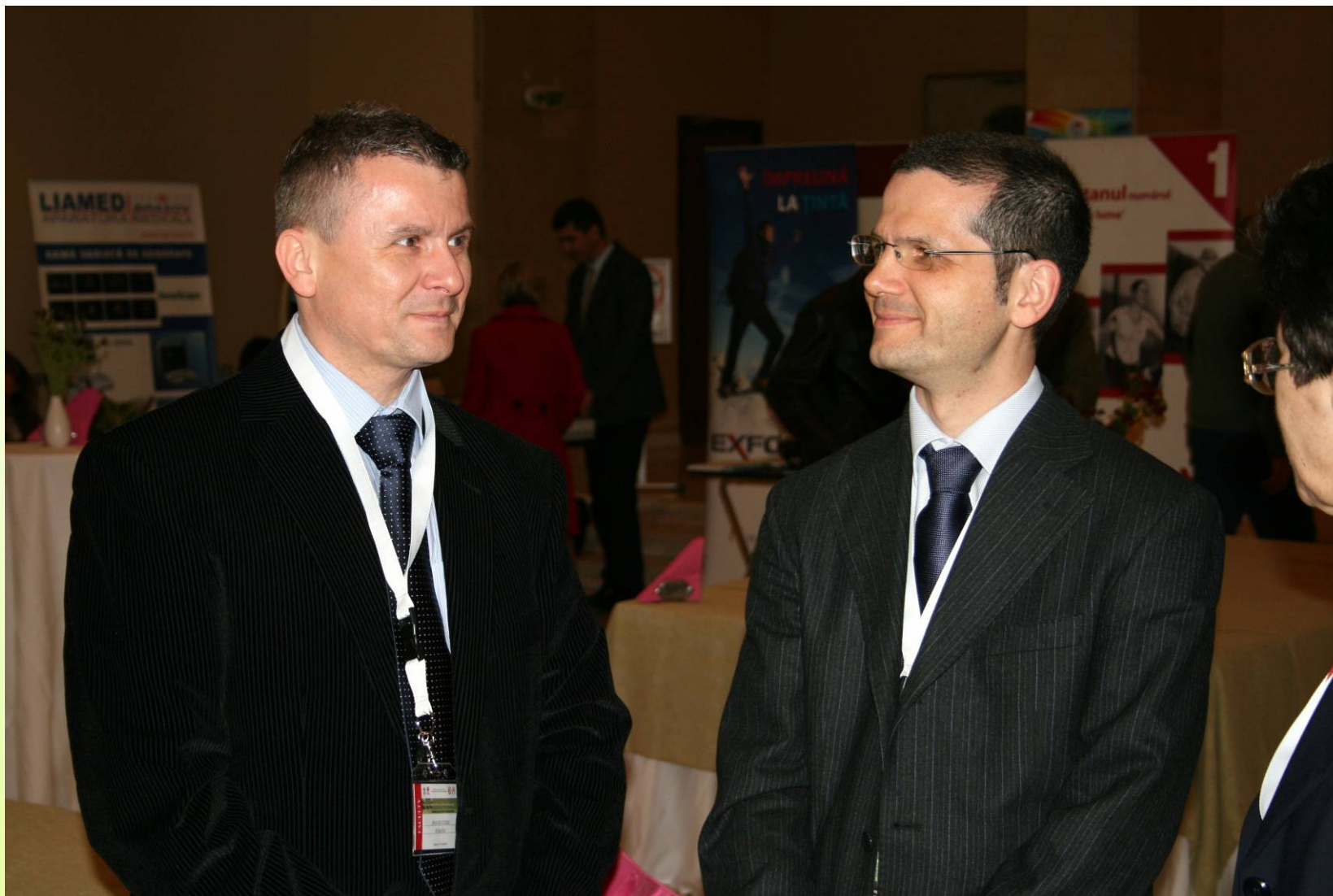
European Course Of Echocardiography – 15 – 17 April 2010, Bucharest