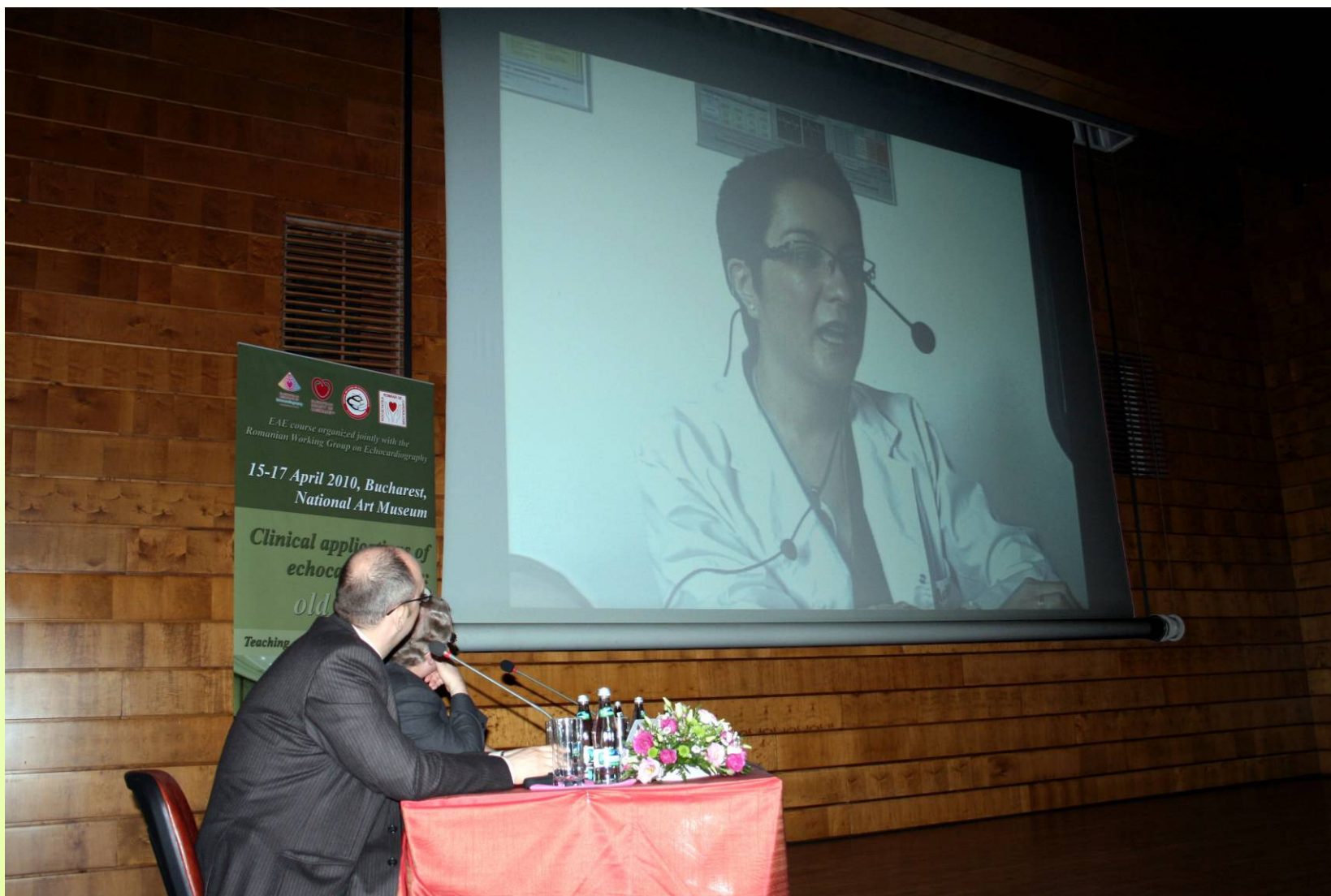
European Course Of Echocardiography – 15 – 17 April 2010, Bucharest