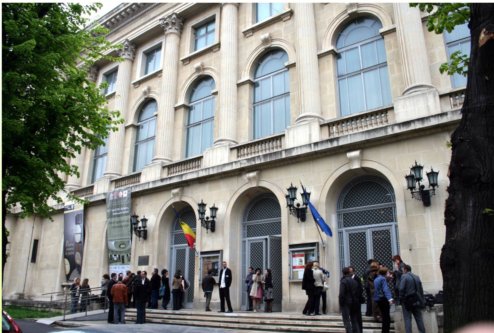
European Course Of Echocardiography – 15 – 17 April 2010, Bucharest