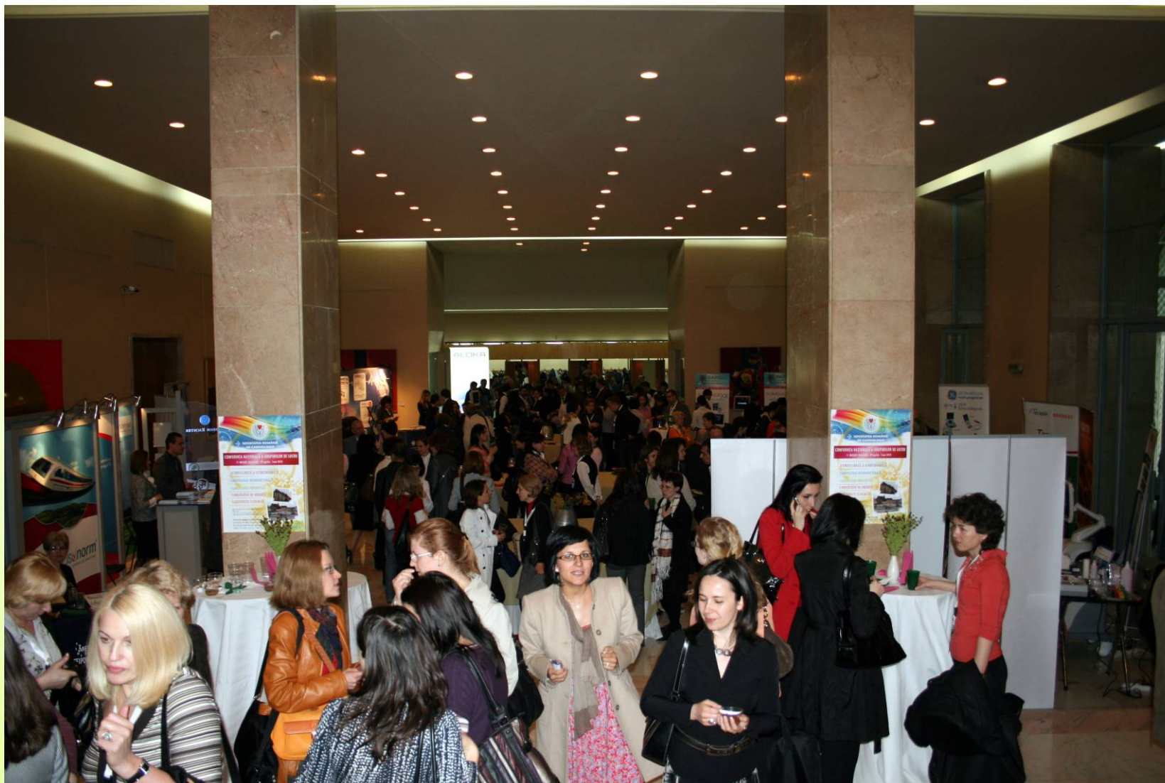
European Course Of Echocardiography – 15 – 17 April 2010, Bucharest