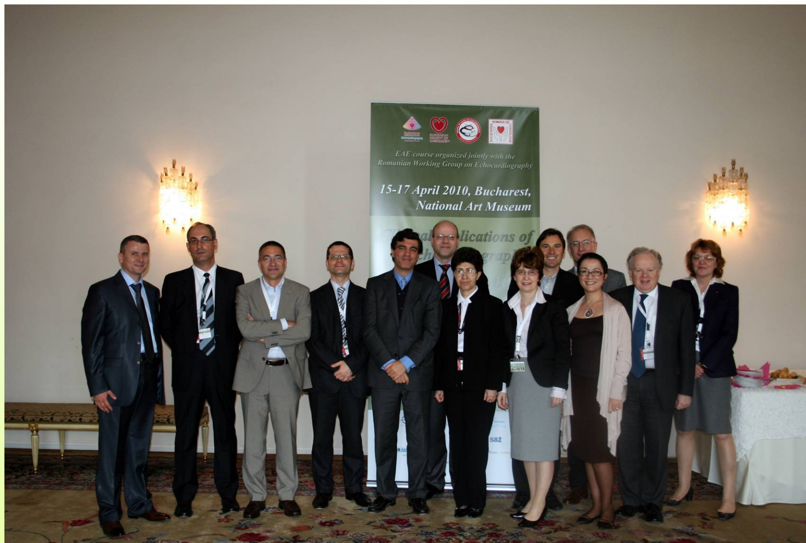
European Course Of Echocardiography – 15 – 17 April 2010, Bucharest