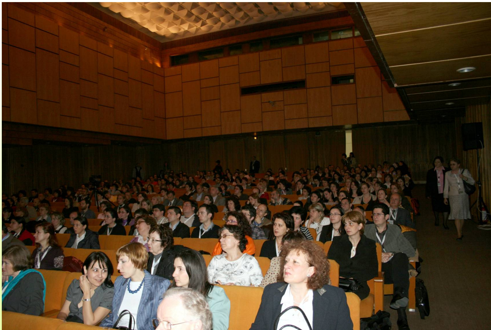
European Course Of Echocardiography – 15 – 17 April 2010, Bucharest