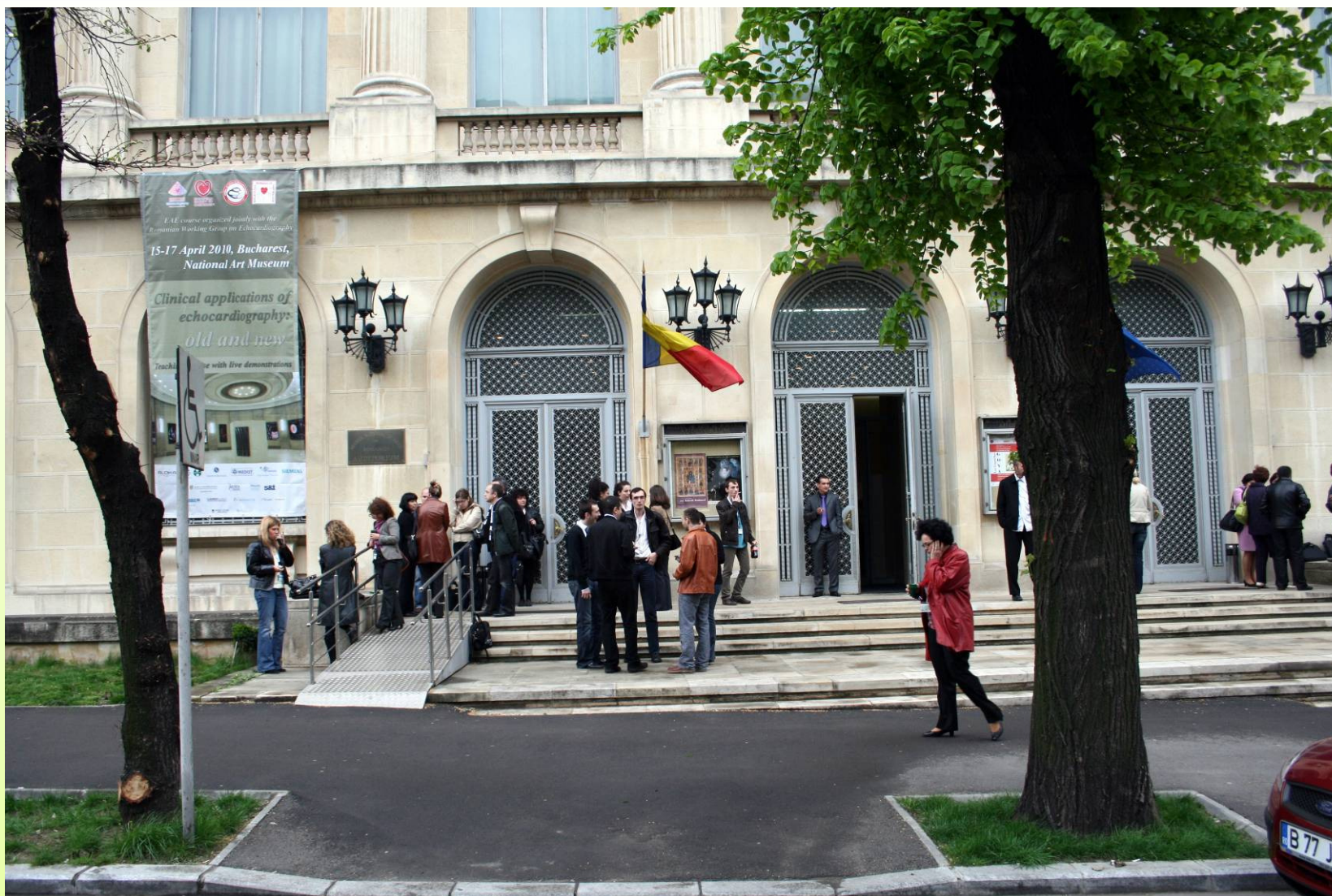
European Course Of Echocardiography – 15 – 17 April 2010, Bucharest