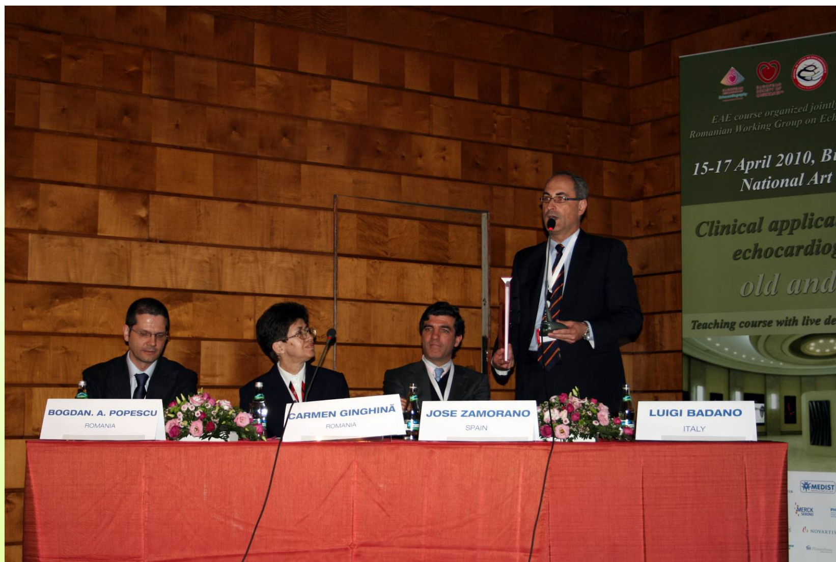
European Course Of Echocardiography – 15 – 17 April 2010, Bucharest