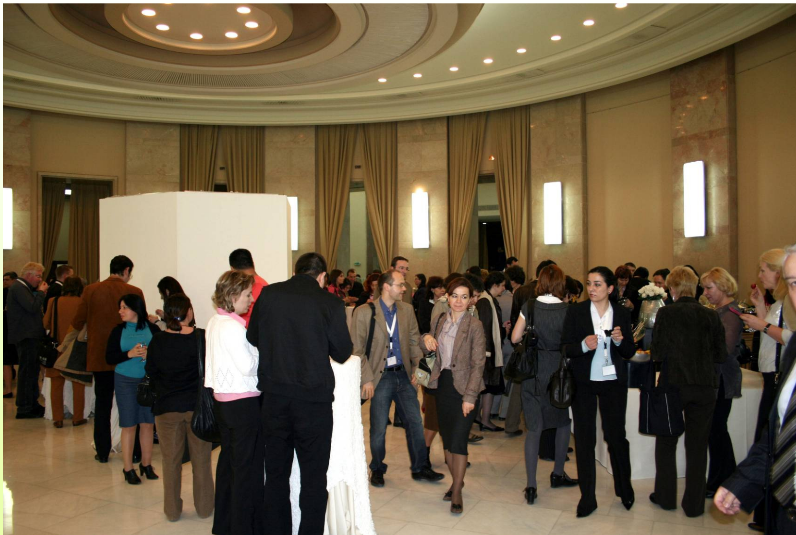
European Course Of Echocardiography – 15 – 17 April 2010, Bucharest