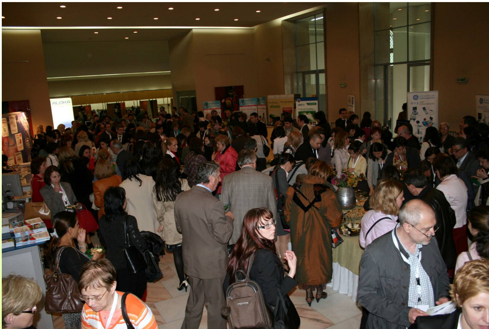
European Course Of Echocardiography – 15 – 17 April 2010, Bucharest