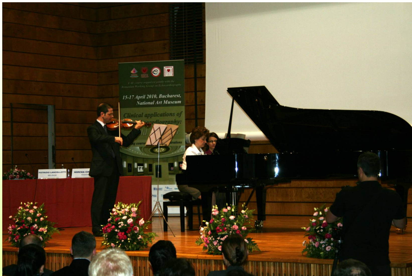
European Course Of Echocardiography – 15 – 17 April 2010, Bucharest