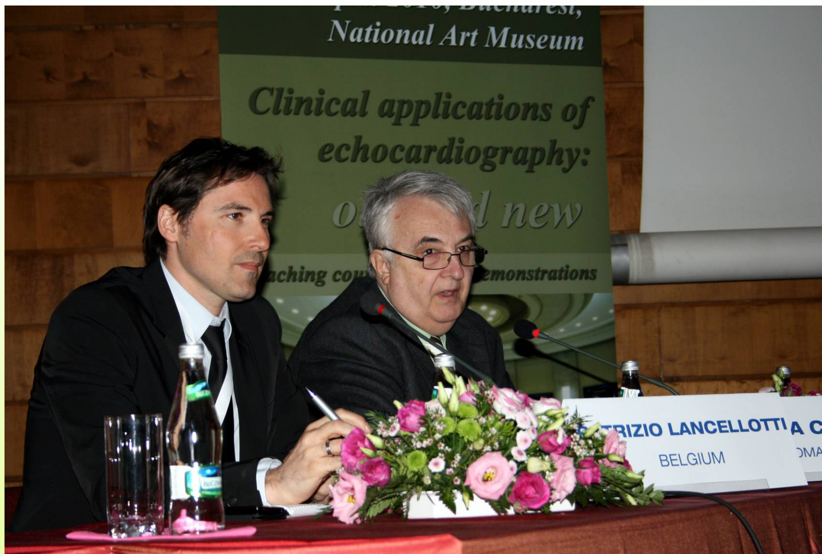
European Course Of Echocardiography – 15 – 17 April 2010, Bucharest