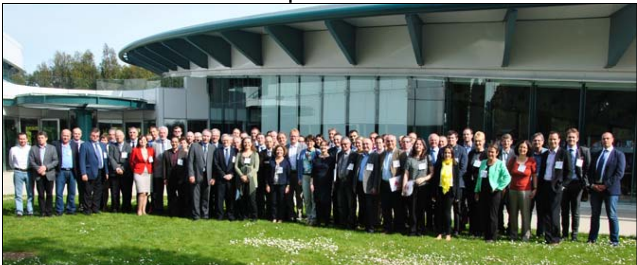
Imagine de la "3rd European ACCA summit on Pre-Hospital Care – 2013"

Thrombosis and anti-thrombotic therapies in acute cardiovascular care